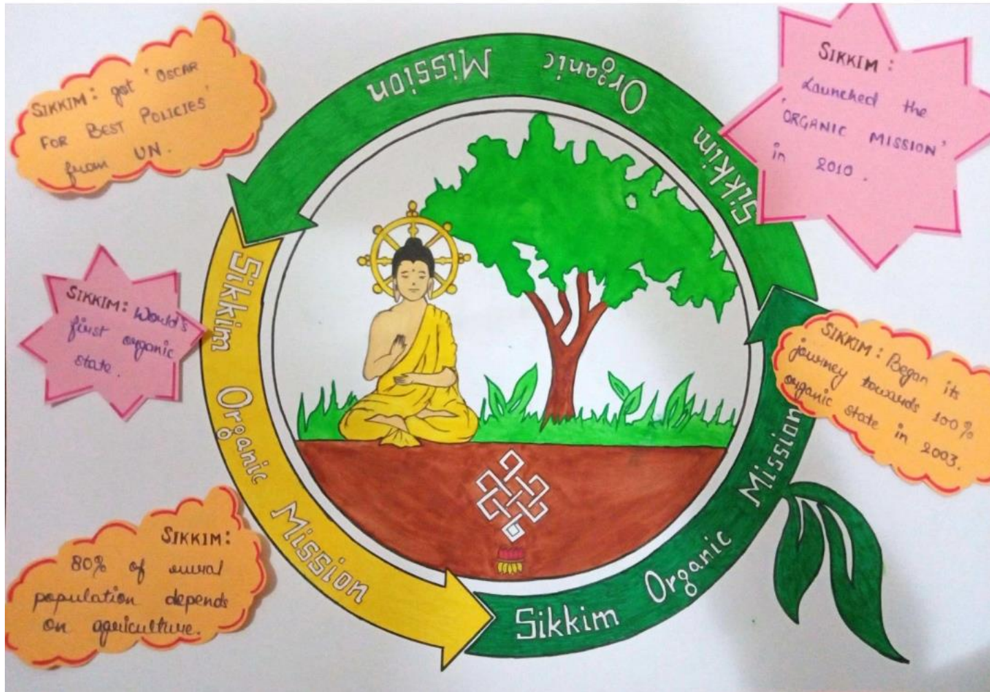
Theme Based, E- Poster making competition organized by Institute of Hotel Management PUSA on 1 st December 2020.